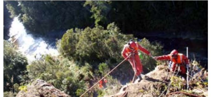
Loading explosives on blast day.